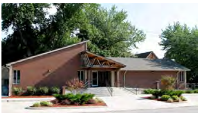
Girard Unified School District No. 248 415 N. Summit Girard, KS 66743

PRSR STD ECRWSS U.S. Postage PAID EDDM RETAIL