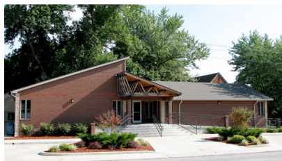
Girard Unified School District No. 248 415 N. Summit Girard, KS 66743

PRSR STD ECRWSS U.S. Postage PAID EDDM RETAIL