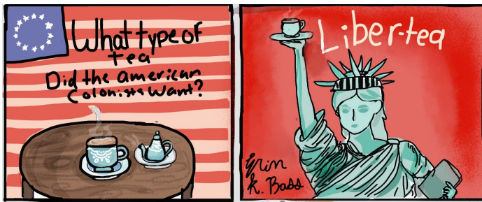
Idea for pen @thequillclub.com