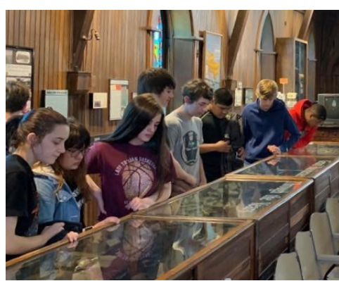
GHS students look at photos and memorabilia from Girard businesses through the years at the Girard History Museum.

Middle school Social Studies classes, as well as RVH 4th grade classes, also made visits to the museum this month.