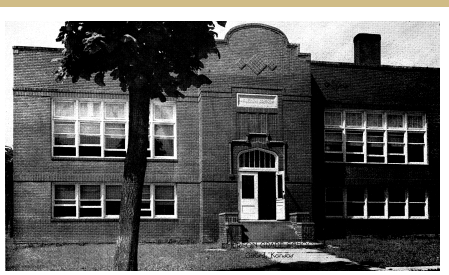
Emerson Elementary, circa 1965

In May of 2014, a $16 million bond issue passed which allowed USD 248 to make the latest improvements to all four district buildings.